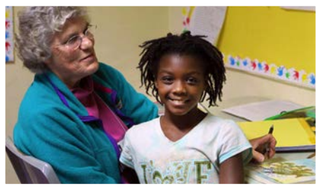
Rise & Shine School of Brevard provides tools for learning and promotes racial justice and equality of opportunity