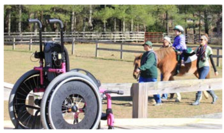
Free Rein Center for Therapeutic Riding and Education