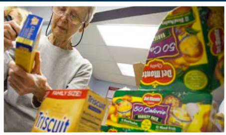
Sharing House provides food, clothing, financial assistance and case management for residents of Transylvania County